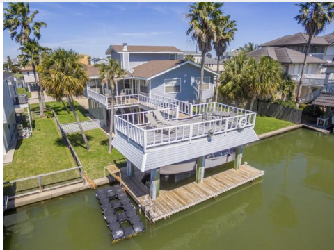
3515 Muscatee Circle $499,000 4/2

Beautiful canal front home in highly desirable location within Pirates Cove. This home sits on one of the widest canals and is perfectly oriented for cool summer breezes. Open floor plan perfect for entertaining.