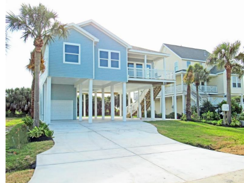
3647 Formast $365,000 4/2

Newly constructed high raised single story home with uninterrupted views of the bay and surrounding wild life preserve. The home will combine comfort and efficient use of space to create a environment of that is energy efficient and economic.