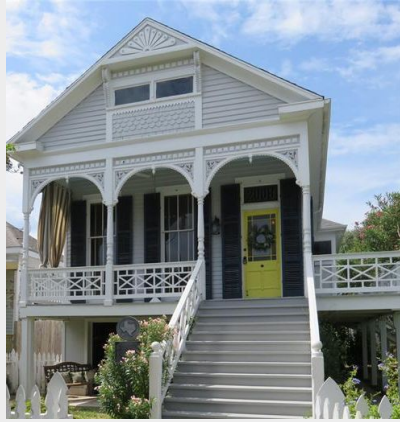
2008 Avenue N 1/2 $389,000 2/2

Located in the heart of Lost Bayou in the San Jac neighborhood, this lovely raised cottage is across the street from the neighborhood community garden. Wide wrap around porches are a great place to relax and catch gulf breezes. Architectural delights include pocket doors, walk through windows, soaring ceilings, beautiful wood floors and sun-filled rooms.